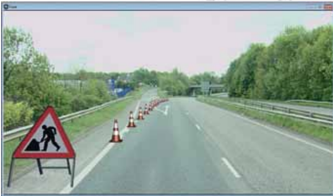
VIRTUAL DESIGN LAYOUT