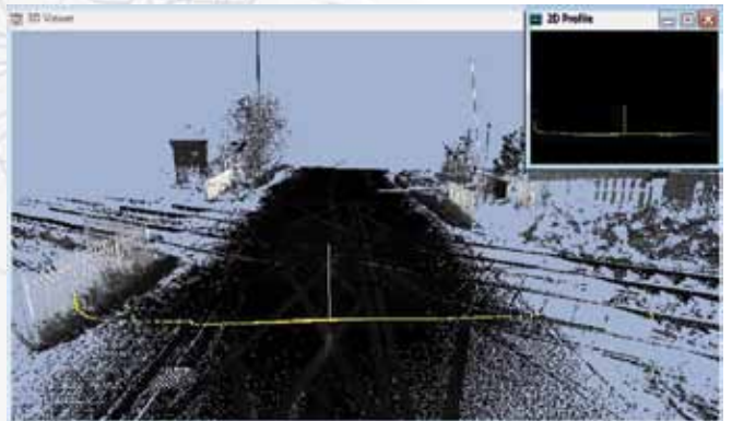
INFRASTRUCTURE LiDAR CAPTURE

For further information on our product range, please contact Omnicom Engineering Limited